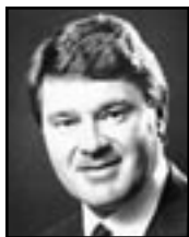
John Swofford, ACC Commissioner

Consistency. It is the mark of true excellence in any endeavor.